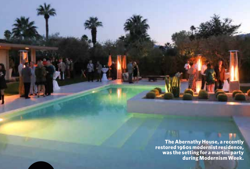
The Abernathy House, a recently restored 1960s modernist residence, was the setting for a martini party during Modernism Week.